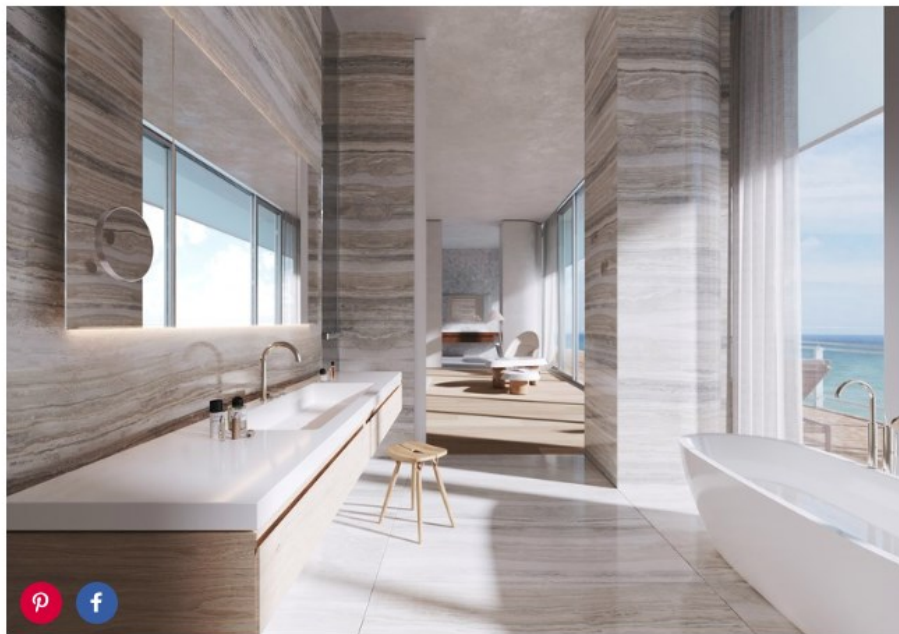
The master bath is swathed in floor-to-ceiling marble.