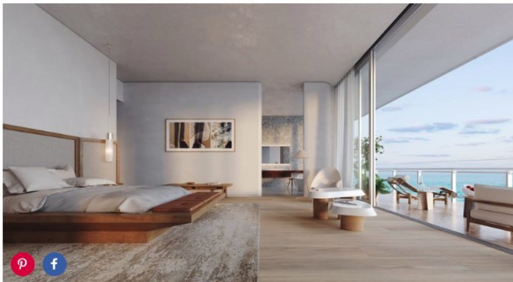
Wake up to a private terrace and uninterrupted ocean views in the master bedroom.

Just when one thinks today's baths can't get any more lavish —Capp proved that no expense should be spared in the penthouse's master. Silver travertine marble spans floor to ceiling, rounded out by an überlong vanity (clutter be damned) and tub with a view. Modern, low-slung furniture and the stacked horizontal details in the glossy marble emphasize and play with the natural horizon line. "Bathrooms are great when it feels like everything is built-in and part of one, not just little bits attached," Capp says. "Though, in fact, there are a lot of details to make it seem like there are very few."