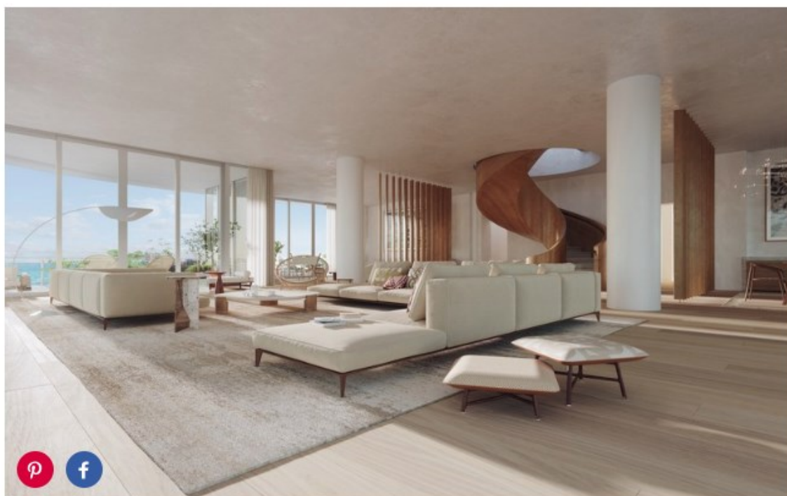
The living room features a sculptural stair fabricated out of wood.

12,410-square-foot interior plus 18,247 of outdoor terrace space—features six bedrooms, three powder rooms, and eight bathrooms. Enter through one of two private elevators, work out in your personal fitness center, or kick back in the home cinema. Floor-to-ceiling windows take in views of a neighboring park, the Miami skyline, and uninterrupted ocean. Outside, the sprawling roof hosts twin infinity pools, alfresco kitchens, a Jacuzzi, outdoor theater, and more. And it's claimed the title of Miami's most expensive listing in 2018, asking a cool $68 million. One might ask, who dreamed this all up? RDAI design director Julia Capp gives AD a first look inside the spectacular residence.