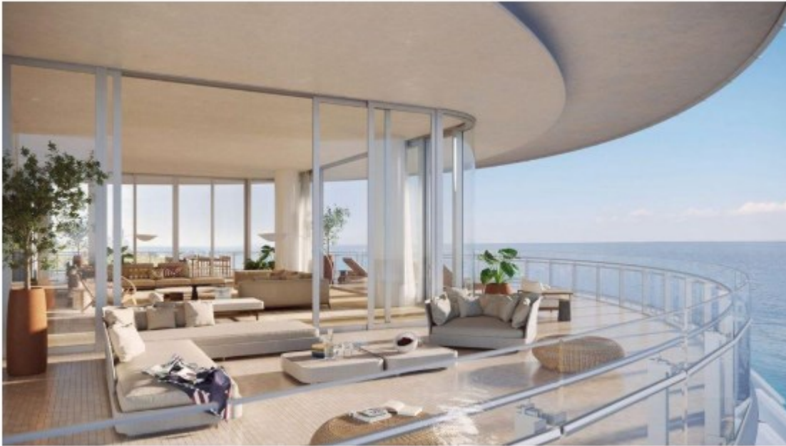
Terrace EIGHT SEVEN PARK

As Art Basel kicks off this week in Miami the city has a new listing to boast about that comes with everything you would expect for the highest-priced penthouse in the area: a celebrity architect, more square footage than its competitors, ocean views that go on forever and, of course, an unusual luxury amenity (as explained below). The 12,410-square-foot unit comes with an additional 18,000+ square feet of outdoor terrace. That means this $68 million condo is the largest penthouse space for sale in Miami if you combine the indoor and outdoor square footage. 🐦 (There is plenty more to be said about the growth of Miami's luxury market so stay tuned for a follow up that looks closely at those specifics.) The six-bedroom, 11-bathroom condo sits on the 18th floor of Eighty Seven Park , a building designed by Pritzker winner Renzo Piano that is already 80% sold and has at least one famous name signed on as a buyer, tennis great Novak Djokovic.