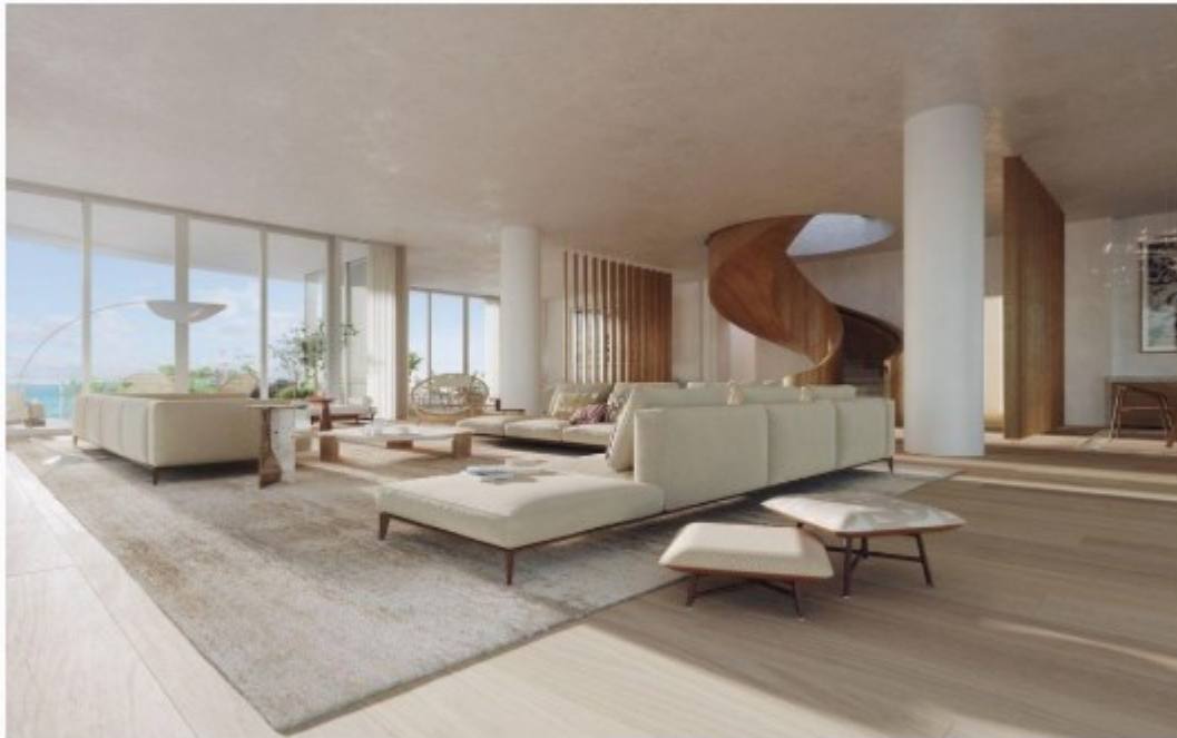
Living Room EIGHTY SEVEN PARK

The entire unit has a subtle contemporary flair with features such as the curved staircase in the living room. In addition to the stairs there are also two private elevators in the unit.