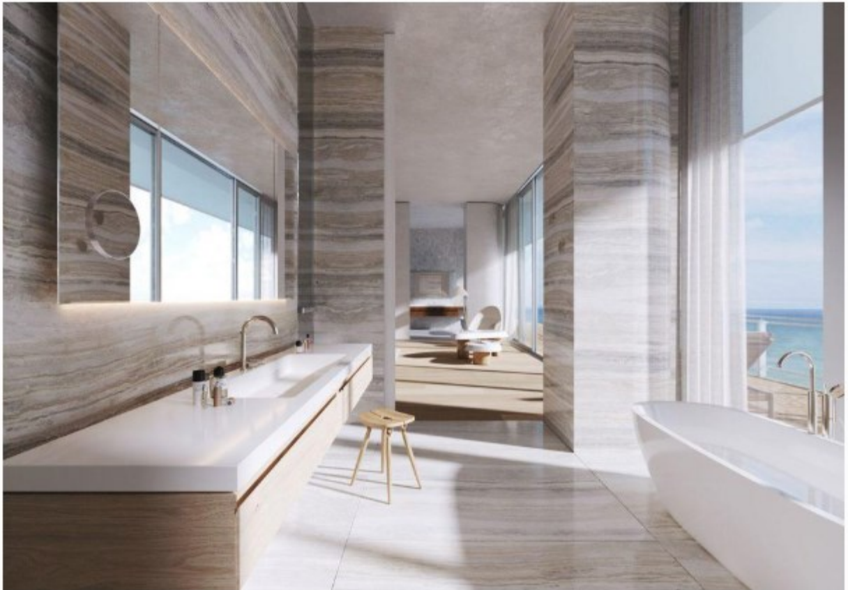
Master bathroom EIGHTY SEVEN PARK

For more information and to see a video interview with Renzo Piano, head to the Eighty Seven Park website .