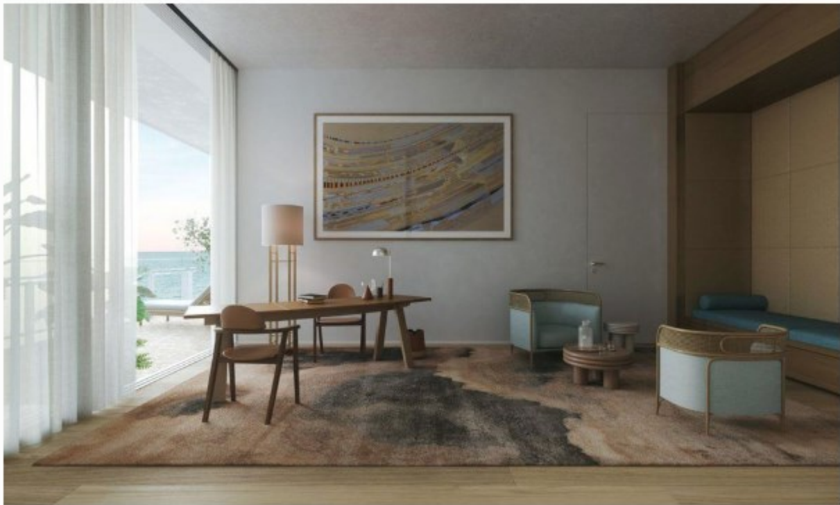
Still life with a built-in? EIGHTY SEVEN PARK

There are two infinity pools, one oriented to take in the sunrise and the other perfectly situated for watching the sunset.