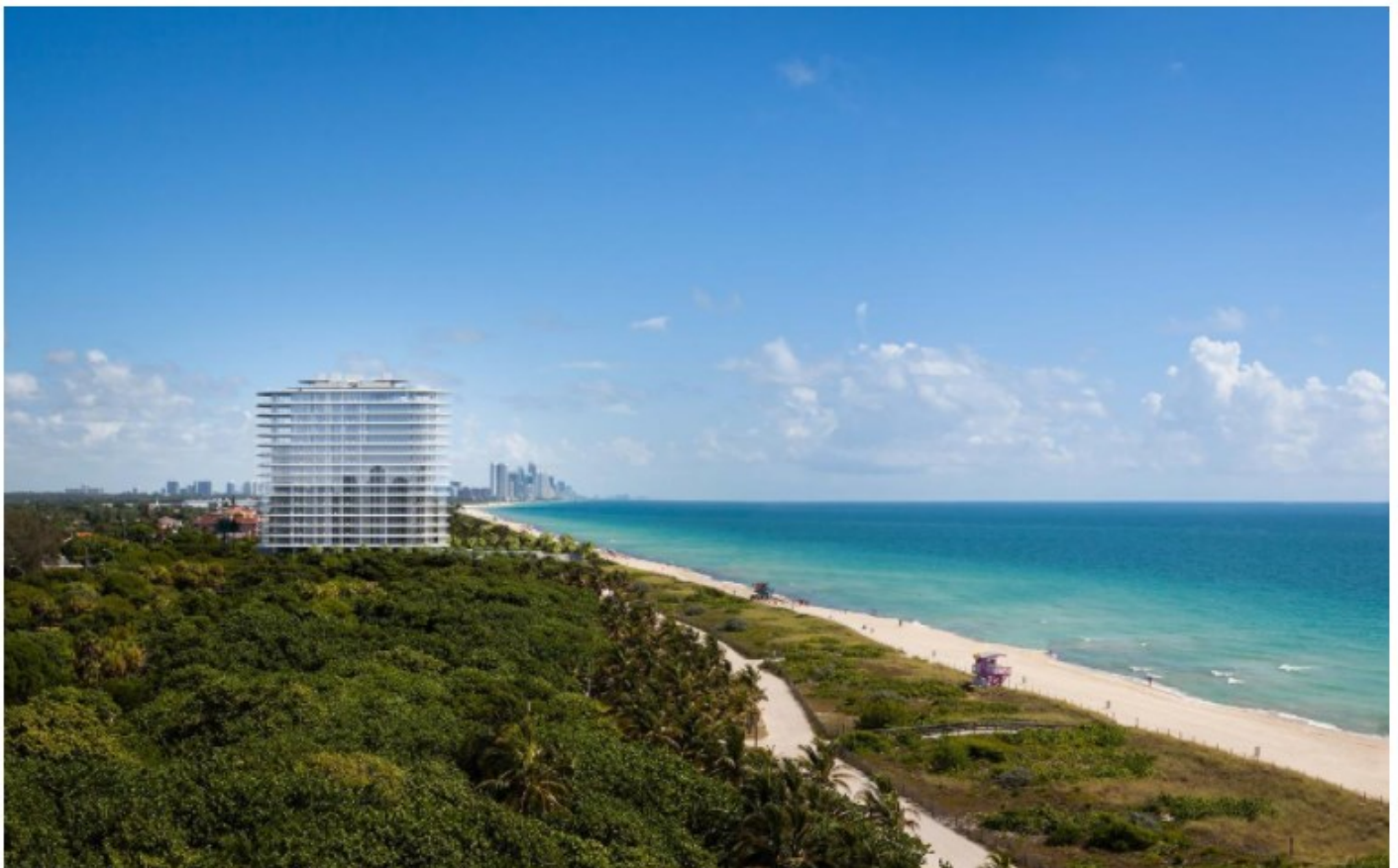
A 35-acre public park, which will also complete the Miami Beach boardwalk, will accompany Eighty-Seven Park