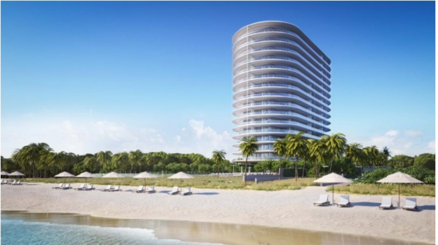
West 8's plans are to create an environment that will enhance the neighborhood and "bring the North Beach community closer together"