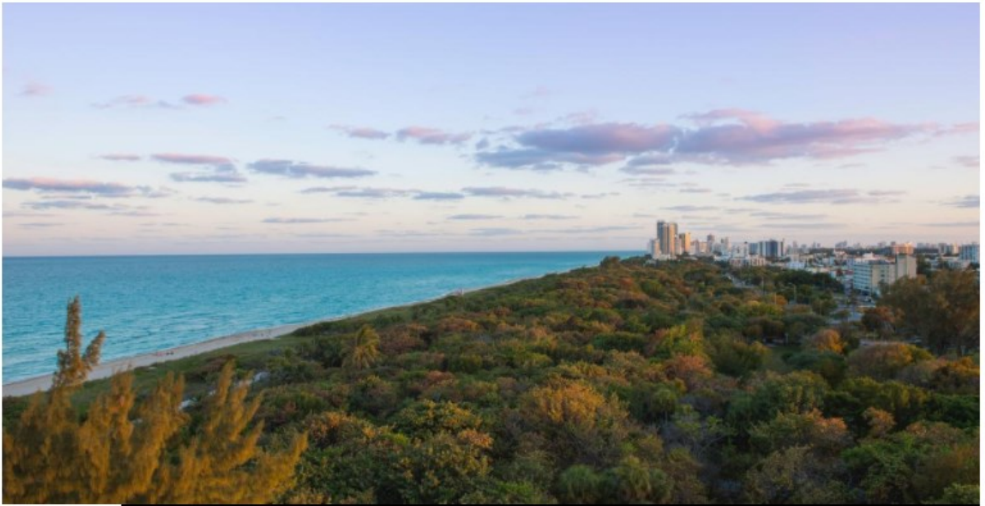
Eighty Seven Park's developer, Terra, is putting $10m (€8.5m, £7.6m) towards the North Shore Park transformation