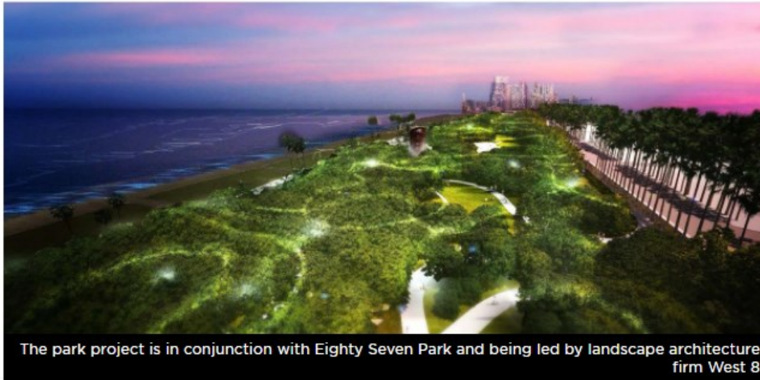
The park project is in conjunction with Eighty Seven Park and being led by landscape architecture firm West 8