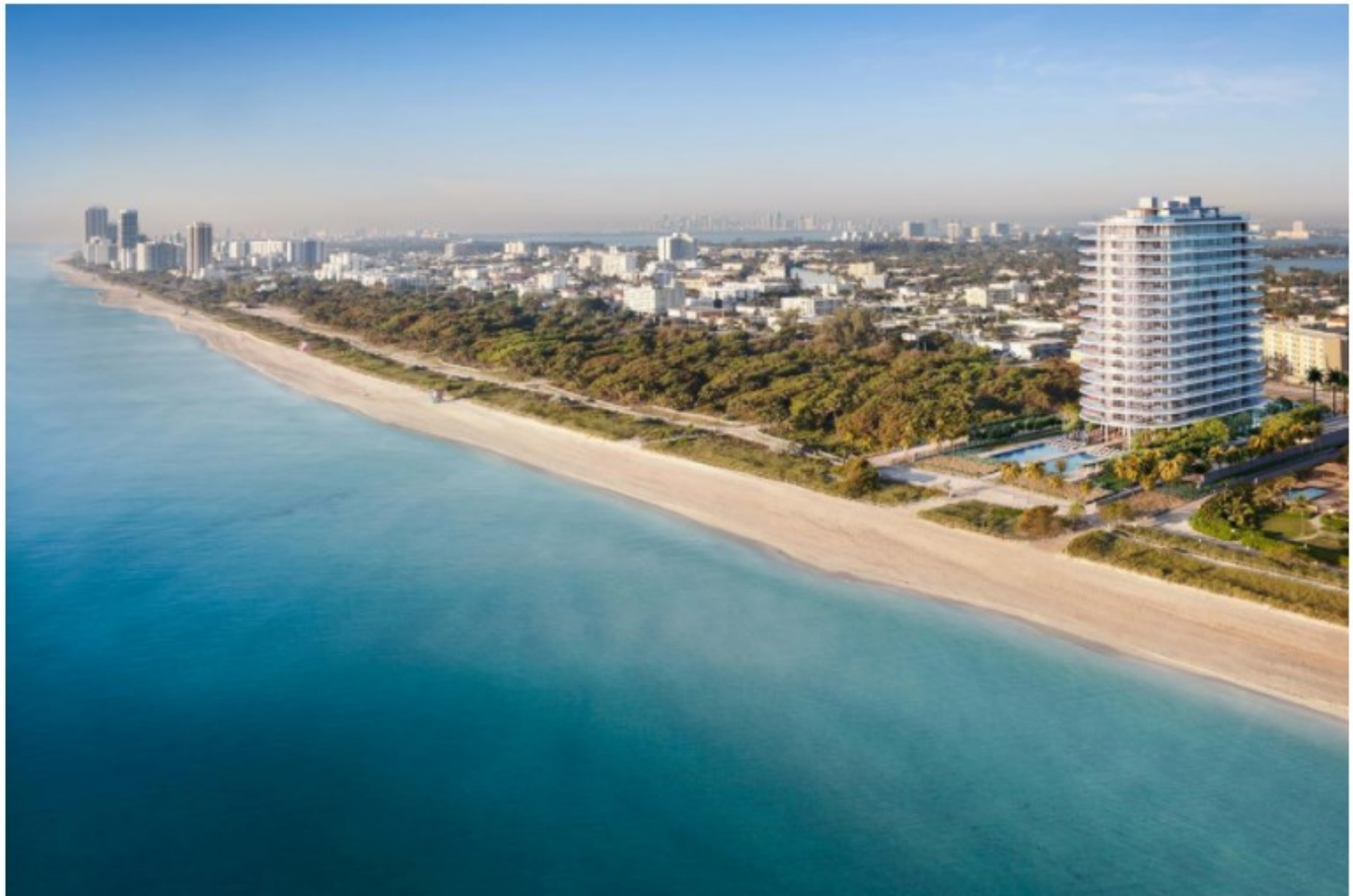
Additional dunes are also being installed along the shoreline of neighbouring Miami Beach as part of the project to protect the land from erosion due to rising sea levels