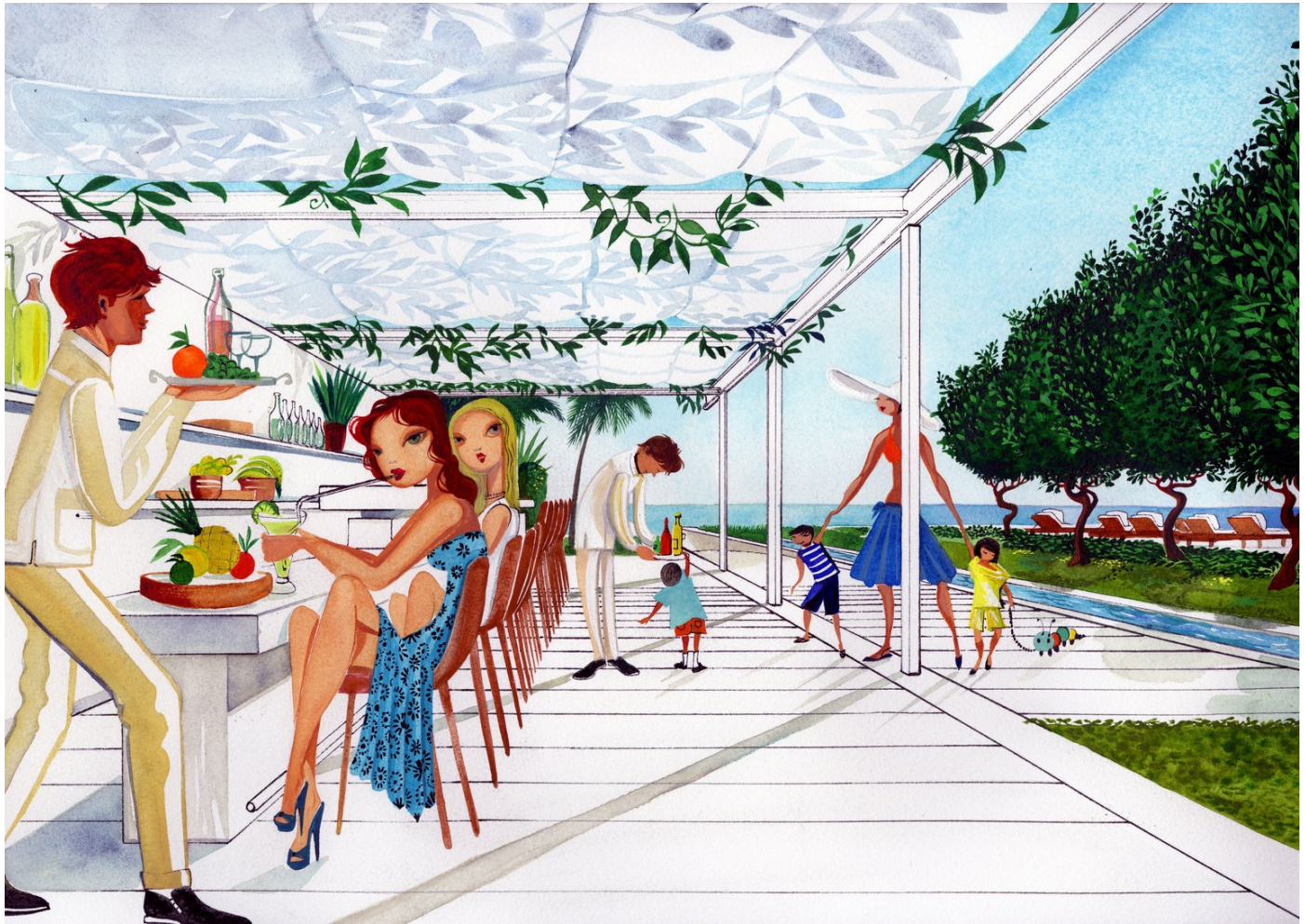
The bar area by Ruben Toledo.

encompassing," he says. "The more we can introduce collaborations and commissions, that elevates the brand and creates an emotional connection to the building."